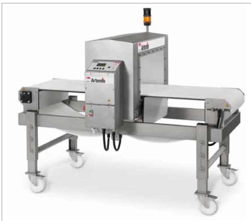
ARTEMIS TMD METAL DETECTOR Product is passed through the detector head on a conveyor. Can detect contamination in packaged product.