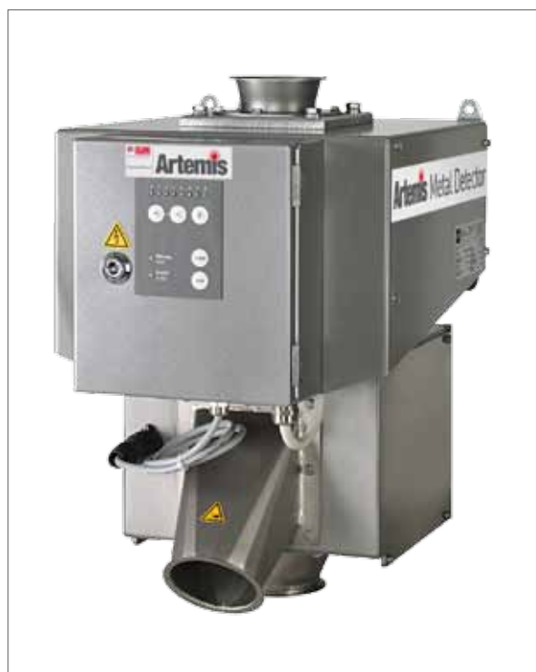
ARTEMIS GFR METAL DETECTOR Designed for gravity-fed lines. Contaminated product is removed from the product flow.