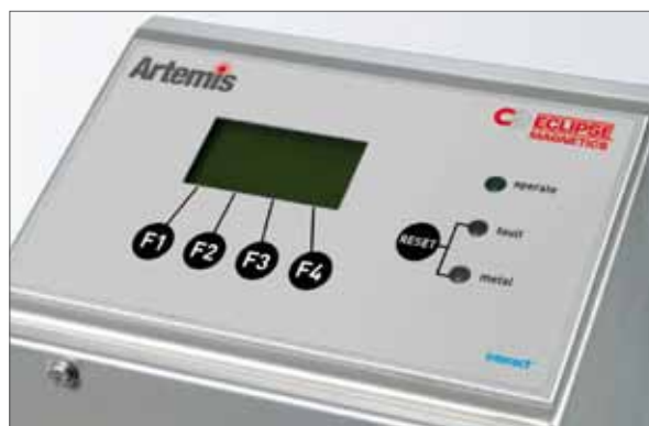
INTERACT+ CONTROLLER The latest in metal detector control